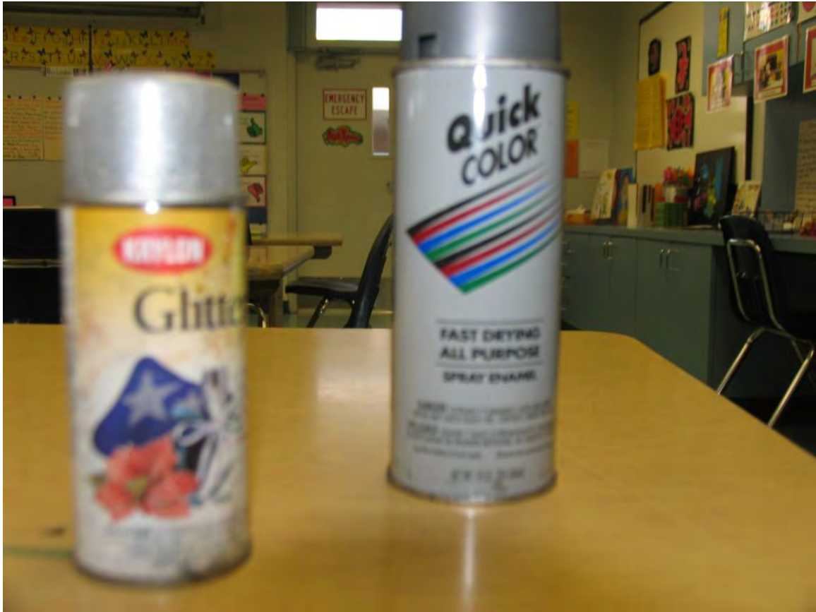
Spray paint can be purchased at Wal-Mart.