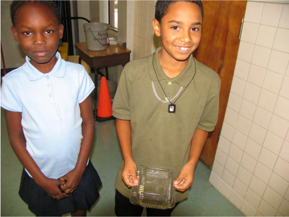
Students can make special plastic charms for necklaces and bracelets from old plastic salad trays.